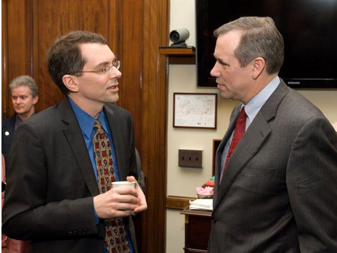
Senator Merkley and me