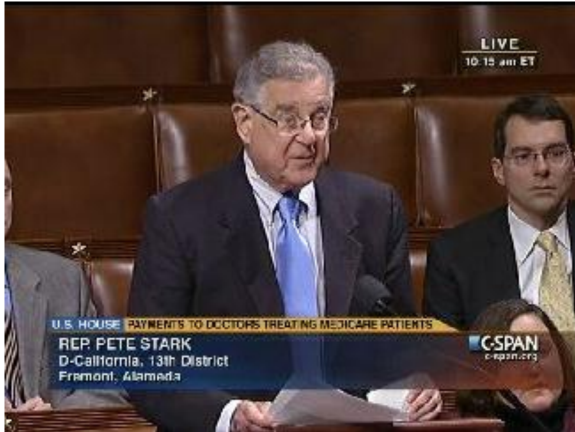
On the House Floor with my boss, Rep. Pete Stark