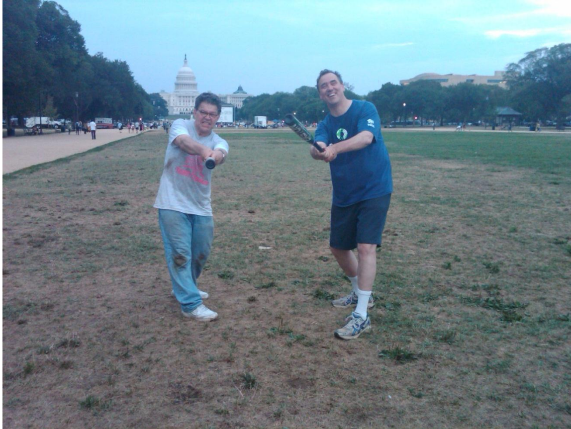
Playing softball with Senators Merkley and Franken