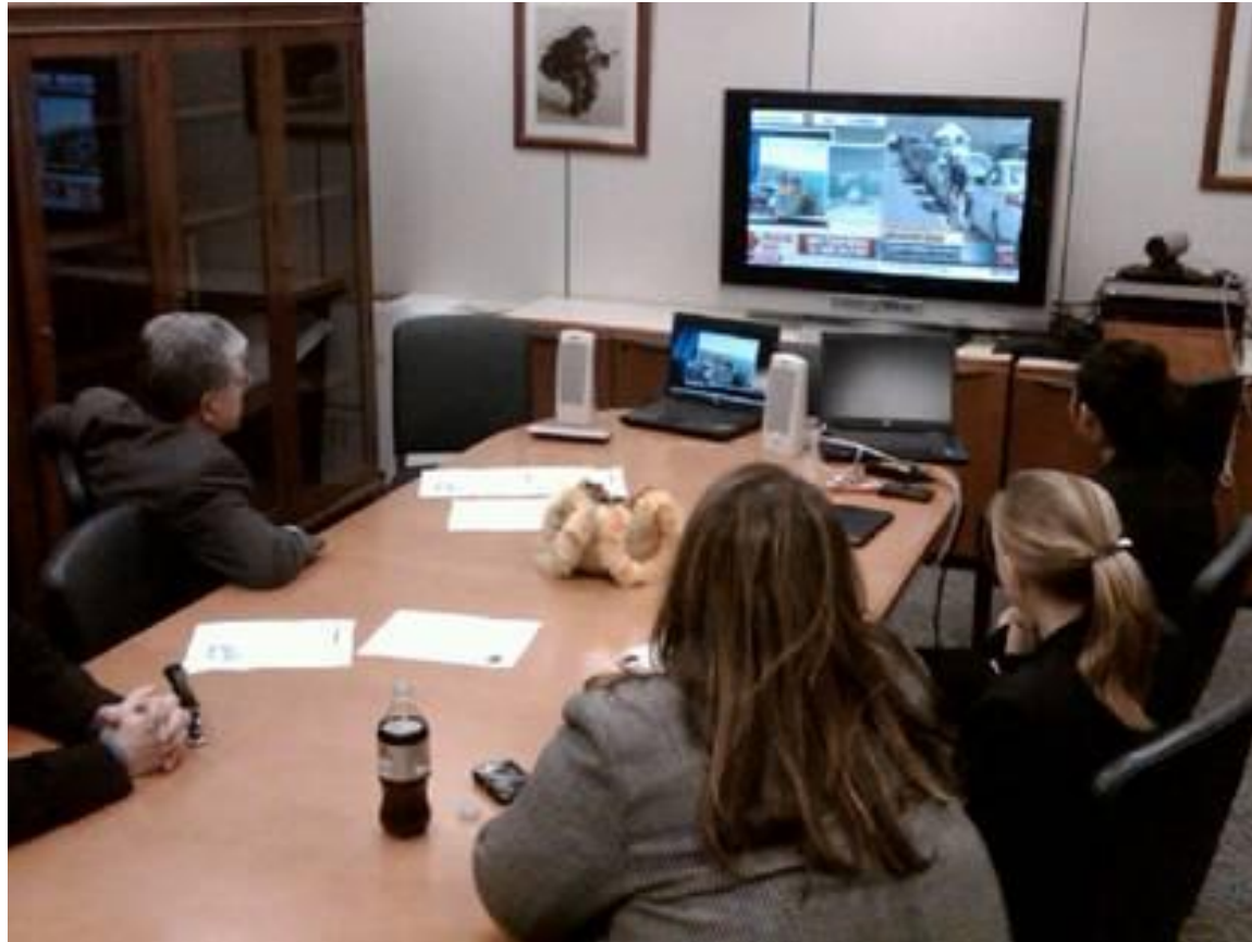
My hands (left) on CNN during Hawaii tsunami alert